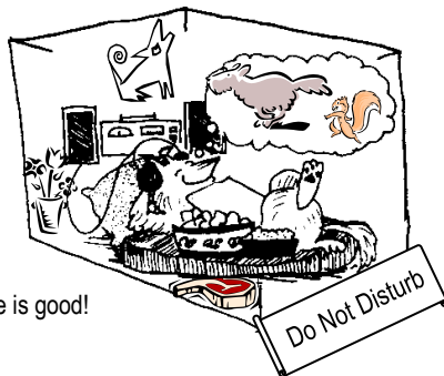
Dog's Perception of "Crate Haven"

Do not let your puppy wander all over without supervision. Keep the pup confined in a small area like a kennel, crate or utility room. Prevent mistakes and reward desired behaviors.