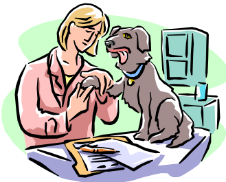
Regular Wellness Health Check-Ups!