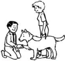
Exercise 4 ◆ Appearance and Grooming Animal may change position