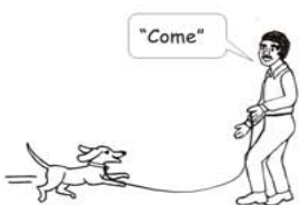
Exercise 11 Come When Called All dogs must do