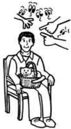
Exercise G ◆ Crowded and Petted by Several People