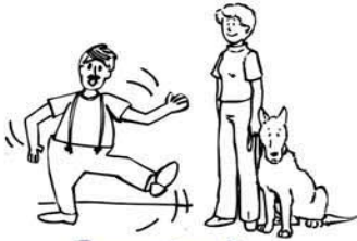
Exercise D Staggering, Gesturing Assistant staggers, then moves normally to pet animal