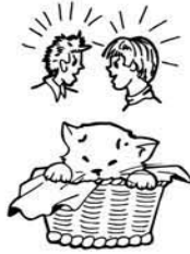
Exercise E Angry Yelling Assistant yells, then calms down and calls animal