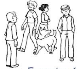
Exercise 6 ◆ Walk Through a Crowd