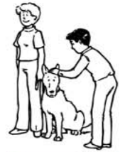
Exercise 3 Accepting Petting Animal may change position