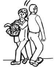
Exercise F Bumped from Behind