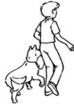
Exercise 5 ◆ Out for a Walk All dogs must walk on floor