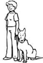
Exercise 8 (med./large dogs) Sit on Command