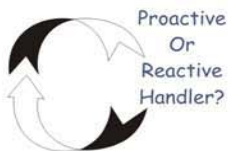
Exercise J ◆ Overall Assessment

The team should: › Be reliable › Be predictable › Be controllable