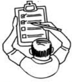
Exercise 1 Review Handler Questionnaire

◆ Indicates exercises used in evaluating complex area placement