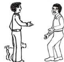
Exercise I Offer Treat