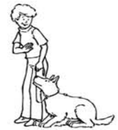
Exercise 9 (med./large dogs) Down on Command