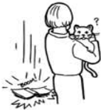
Exercise 7 Reaction to Distractions One visual and one auditory