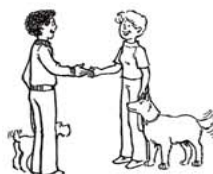
Exercise 12 Reaction to Neutral Dog