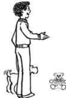
Exercise H Leave It