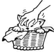
Exercise B ◆ Clumsy Petting