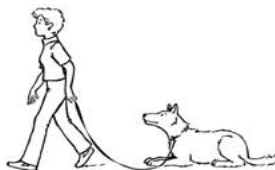
Exercise 10 ◆ (med./large dogs) Stay in Place 10 ft line with a 2-3 second pause