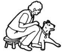
Exercise C ◆ Restraining Hug