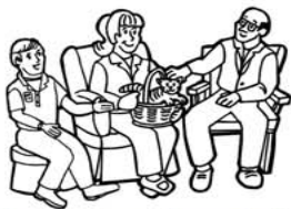
Exercise 8 and 9 (small dogs/cats) Animal Passed to 3 Strangers